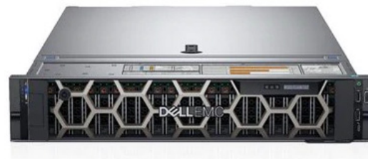
Dell PowerEdge R740xd 48TB/96TB