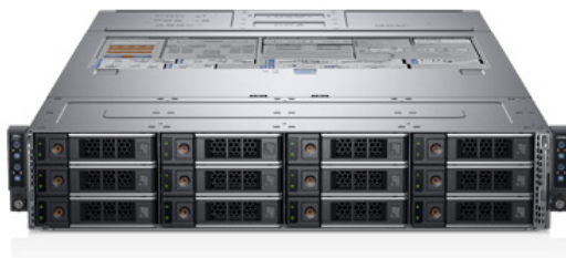
Dell PowerEdge C6420 24TB/36TB